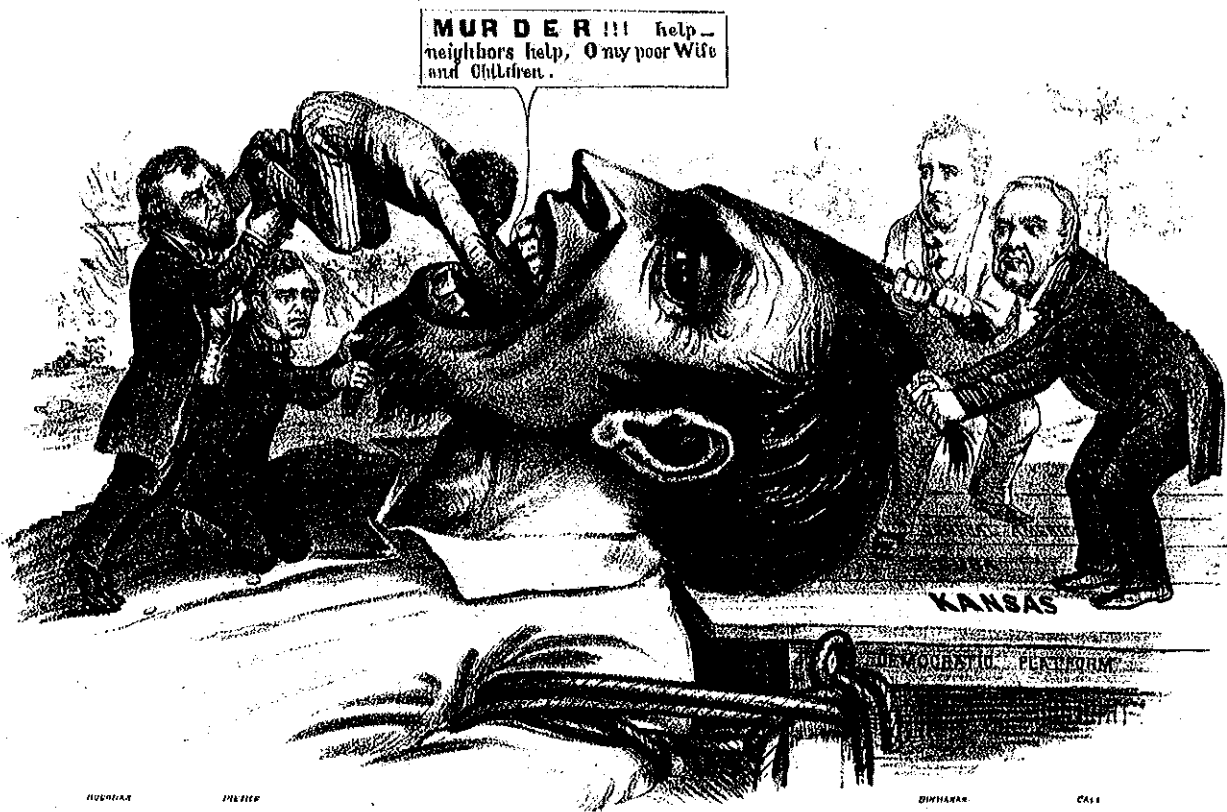
FORCING SLAVERY DOWN THE THROAT OF A FREESOILER

The cartoon on this page appeared during the 1856 presidential campaign. Study the cartoon and then answer the questions that follow.