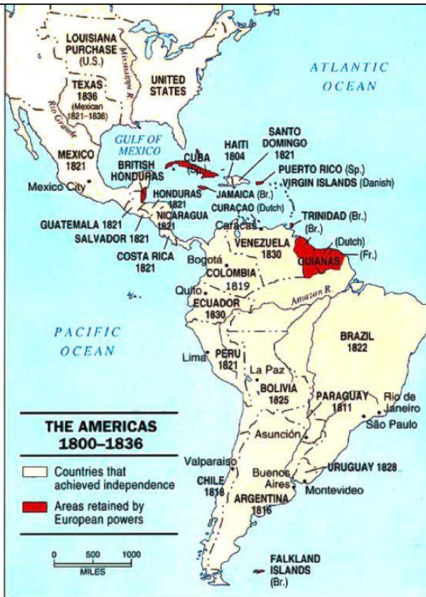
Americas, 1800-1836 http://www.loyno.edu/~seduff/mops.html

According to the information on the slide at the left, what was happening to European Colonies in the Western Hemisphere?